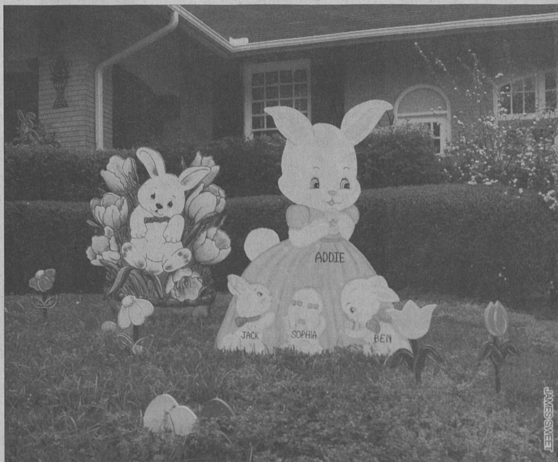
Signs of Easter have sprung up all over Eagle Lake as the holiday nears.